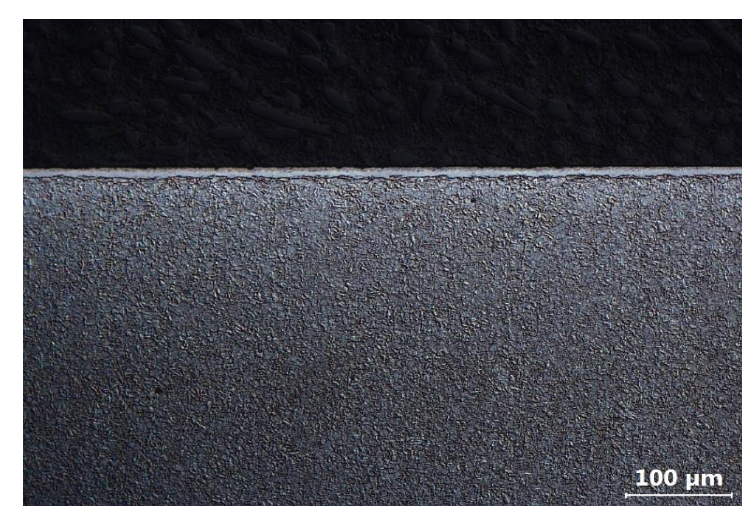
Figure 1: Representative photomicrograph of the hardened section microstructure. DIC Illumination, 3% Nital Etch